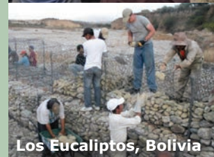
Los Eucaliptos, Bolivia